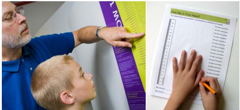
Measure yourself in nanometers!